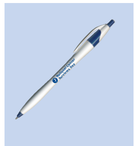
8. Pen – White pen with blue logo and trim. No date. .49 cents each