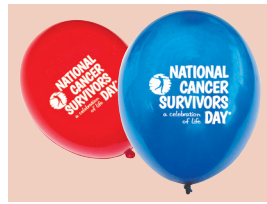
2. Balloon – Mixed red and blue 11" balloons with white logo. No date. .55 cents each

PAYMENT METHODS: Check, Money Order, American Express, Discover, MasterCard, or Visa ORDERING INSTRUCTIONS: