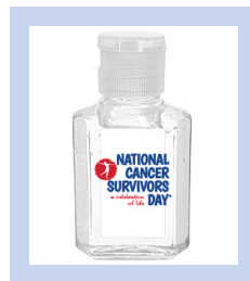
10. Hand Sanitizer – 1 oz. FDA-approved sanitizer. No date. $1.85 cents each