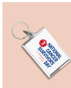
7. Key Tag – Clear plastic 1½" by 2¼" rectangular key tag has a multicolor NCSD logo. No date. .55 cents each