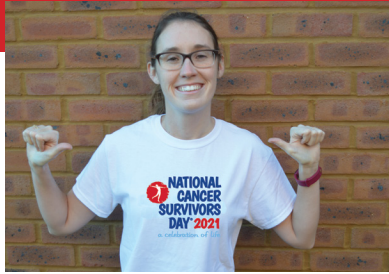
1. T-Shirt – Multicolored logo is printed on white t-shirt. Souvenir dated 2021. Specify size: S, M, L, XL $6.95 each XXL $8.95 each XXXL $9.95 each