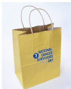
6. Paper Bag – Yellow colored paper bag with blue logo measures 8" wide by 10" high with a 4¾" gusset. No date. 79 cents each