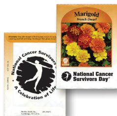
9. Marigold Seed Pack – Black logo on front and back. No date. .59 cents each

The nonprofit National Cancer Survivors Day Foundation has arranged for the manufacture of these items for use by participating organizations hosting registered National Cancer Survivors Day® events. Souvenir dated merchandise states year only – no specific date. Actual merchandise items may vary from those shown and are not shown at actual size. The Foundation reserves the right to not produce any or all of the items in this catalog; in which case, payments would be returned. You must register your 2021 NCSD event to be eligible to order merchandise. There is no cost or obligation to register. Go to ncsd.org , or call (615) 794-3006.