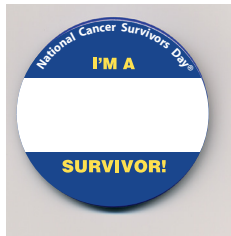
3. Survivor's Button – Fill in the blank on 2¼" blue, white, and yellow button. 30 cents each

Phone _____ - _____ - _____ Event Date (If not June 6) _____